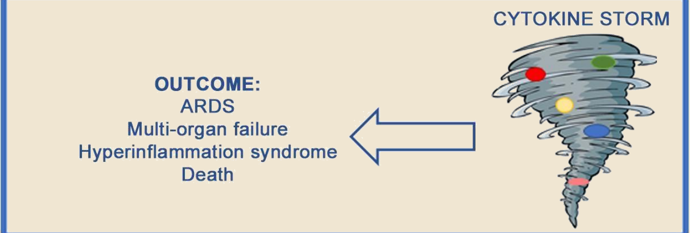
Chart Date 10/6/20 ©2020 GrassrootsHealth Castelli et al., Front. Immunol, 2020.